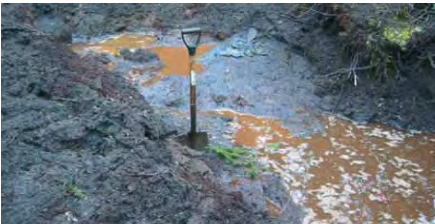
At the Dom discovery.

If most of the mines in Canada were found next to a surface showing, think of how many more Voisey Bay and Eleonore mines can be found with the help of prospectors using Beep Mats in areas where sometimes 40% of the bedrock is less than one meter below surface. Remember, the Geiger counter doubled the worldwide reserve of uranium in the mid-70s by founding new uranium mines in Canada. Let's keep prospecting and dreaming of the next big one! ■