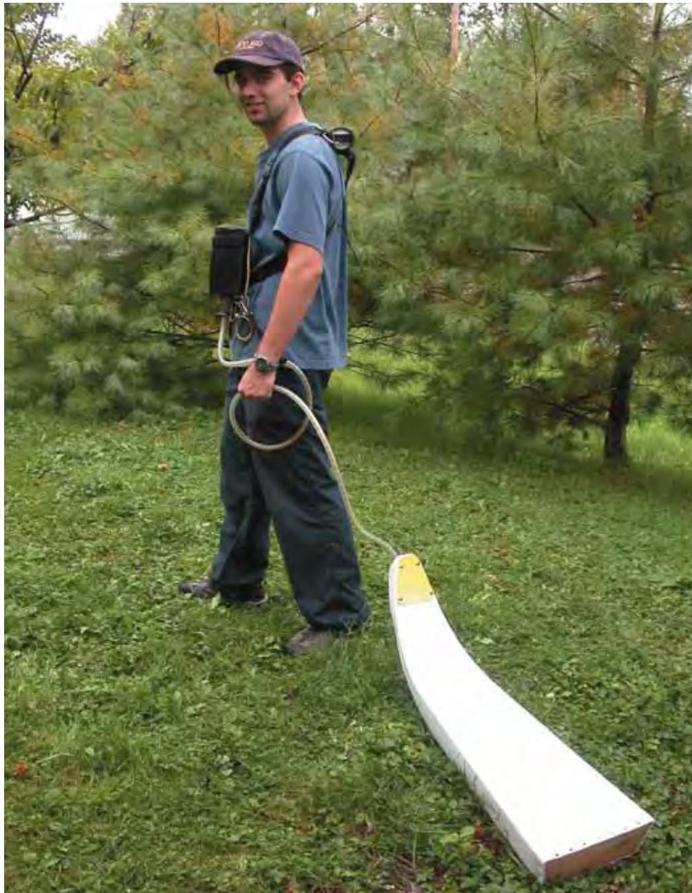
The Beep Mat in action.

Let's have a quick look at some of the latest successes of Virginia Gold Mines Inc., a junior awarded the title "Prospector of the Year 2006" at the Prospectors and Developers Association of Canada (PDAC) convention in Toronto. The Bill Dennis Prospector of