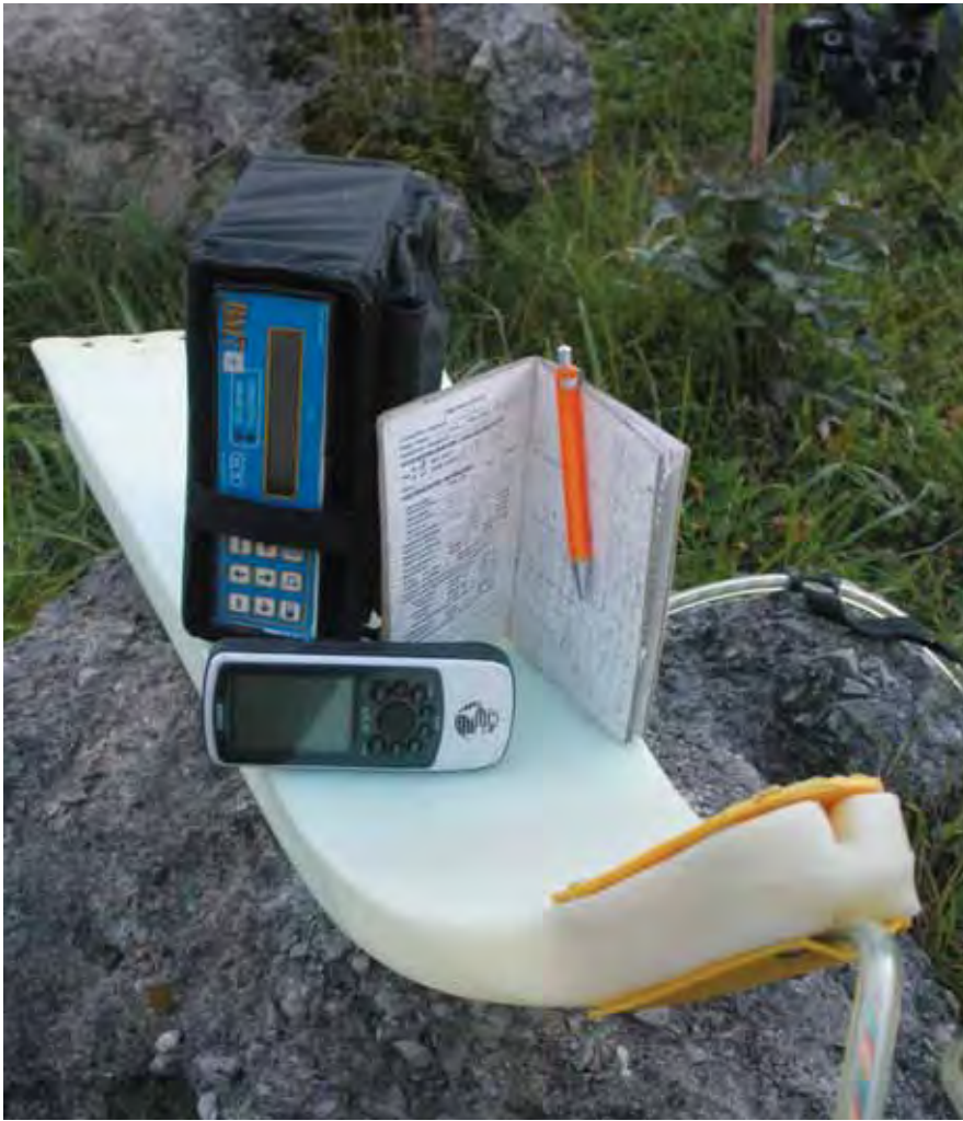
The essential gear.